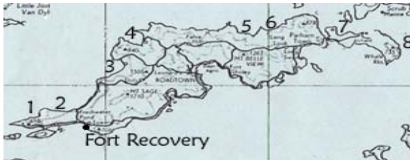
Beaches: 1.Smugglers Cove 2.Long Bay 3.Cane Garden Bay 4.Brewers Bay 5.Josiah’s Bay 6.Elizabeth/Lambert Beach 7. Long Bay Beef Island 8. Trellis Bay

Becky seemed alarmed. Upon investigating, we found a small brown puppy with his head caught in the fencing between the office and our private residence. We helped the poor little guy out and adopted him (Bo) into our Family. He quickly became Becky’s protégé, only a quarter of her size. Don’t be surprised when you see him prance up to you with a Coconut in his mouth! If you’re wondering what kind of breed he is, we will always tell you “Island