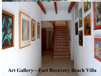
Art Gallery—Fort Recovery Beach Villa